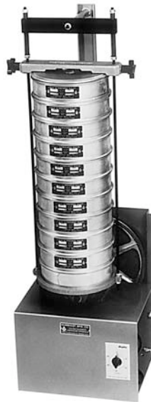
H-4325, H-4330 & H-4310