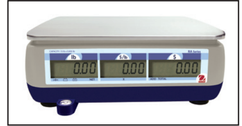
RA Series rear display