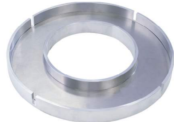
H-3212.13 Casting Mold